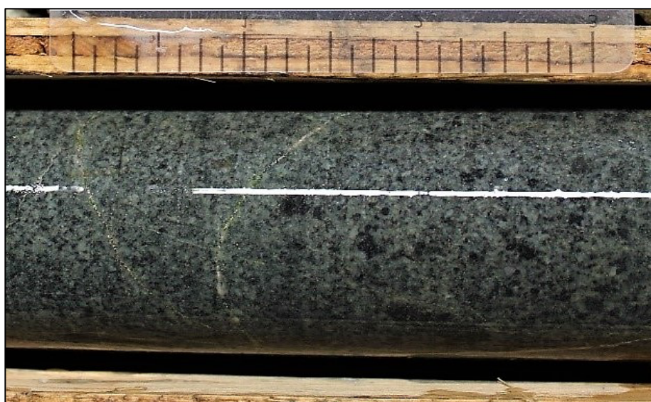
Figure 3: Example of core from 2021 Drilling at MPD: MPD-21-029: Biotite-magnetite clots with fine disseminated bornite-chalcopyrite mineralization hosted in altered microdiorite. Core is at 653 metres within a 219 metre intercept reporting 0.45% Cu, 0.24 g/t Au and 1.52 g/t Ag from 464 to 683 metres.

**Intervals are downhole drilled core intervals. Drilling data to date is insufficient to determine true width of mineralization.